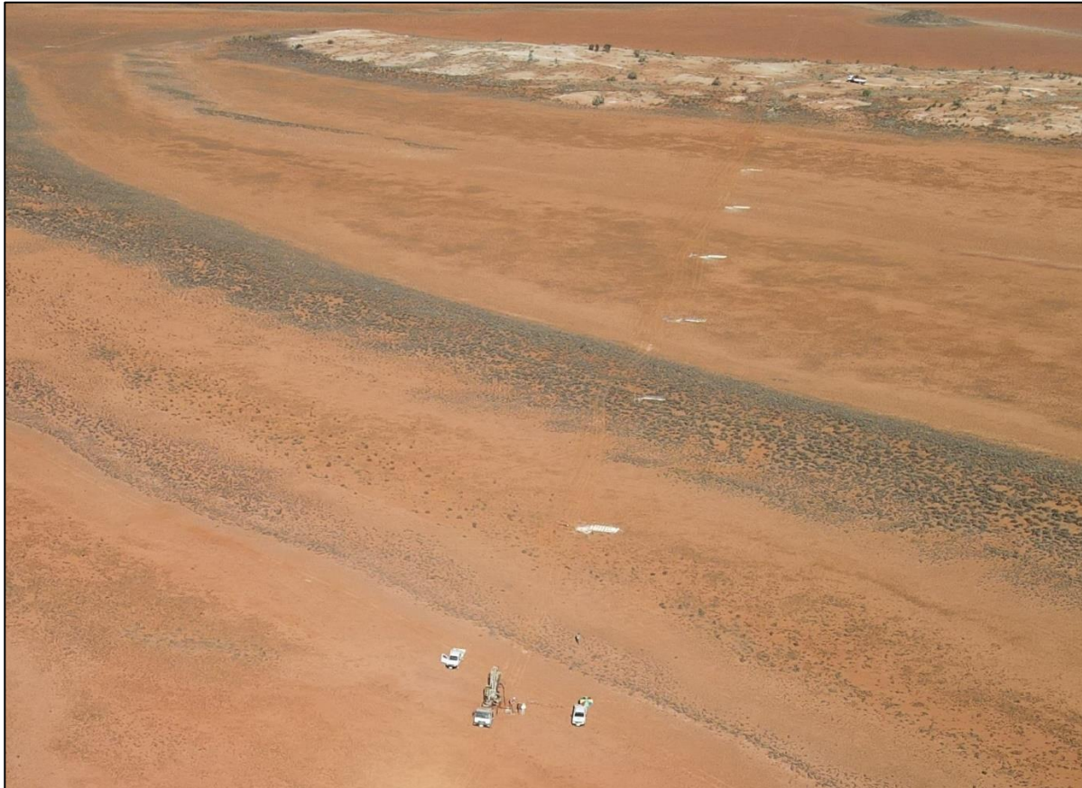
Figure 1. Aircore drilling at Kanowna East – January 2021

This stage-1 program of wide-spaced aircore drilling has been designed to test the bedrock geochemistry beneath the cover sequence of lake clays and sands. This will give Metal Hawk’s geologists a better understanding of where the gold system could be at depth in order to develop targets for stage-2 exploration.